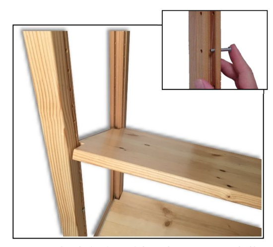
Insert 4 Steel Pins in Upright Holes to support shelf. Slide shelf into upright.