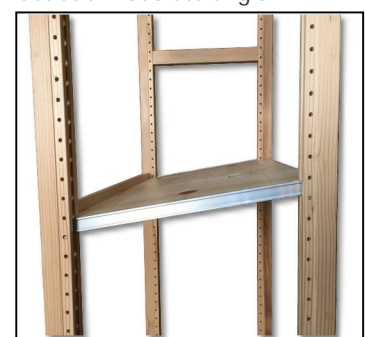
Set pin in back 2"higher than pin in front. Shoe shelf cannot be angled any more than this

Questions? Call us Toll Free in US: (888) 989-1370 Monday - Friday, 8:30 - 5:00 Pacific Standard Time