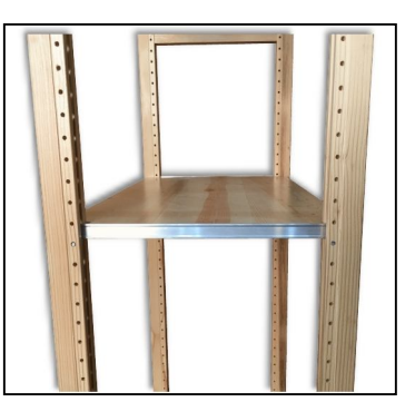
Height is adjustable on 1" increments.