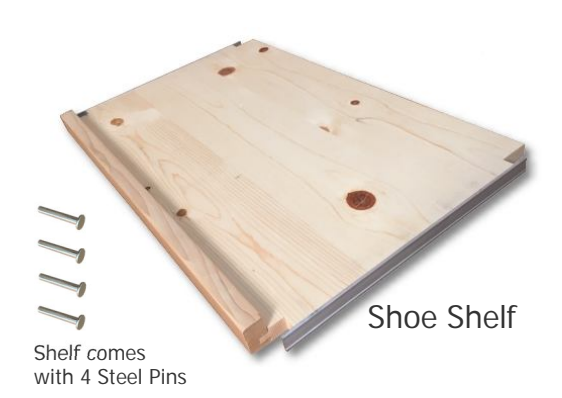
Shoe Shelf set at a slight angle.