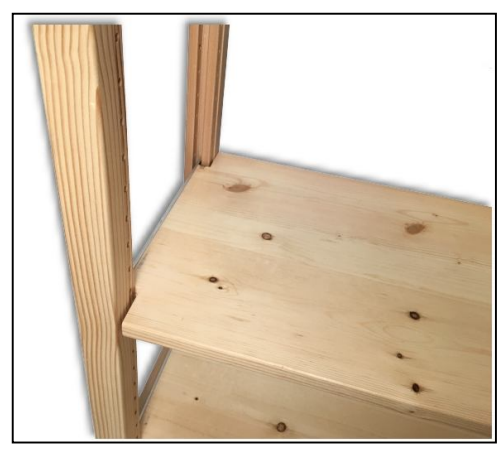
The metal bar on the end of each side of the shelf will rest flat on steel pins.