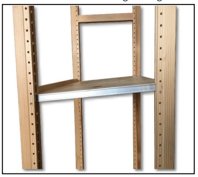
Set pin in back 1"higher than pin in front