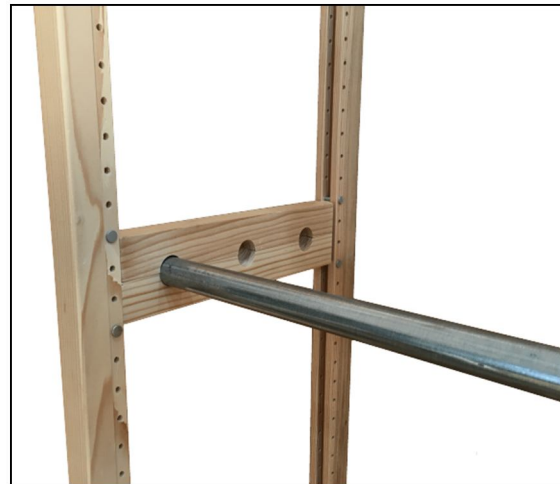
Set top wood rail and secure with additional pins

Our Hang Bars are Commercial Grade for incredible strength!