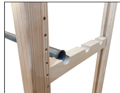
When using a shared upright, use the same rail to support bars on both sides.