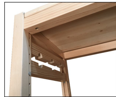
Hint: When installing near the top, slide in both rails before you insert the steel pins.

Questions? Call us Toll Free in US: (888) 989-1370 Monday - Friday, 8:30 - 5:00 Pacific Standard Time