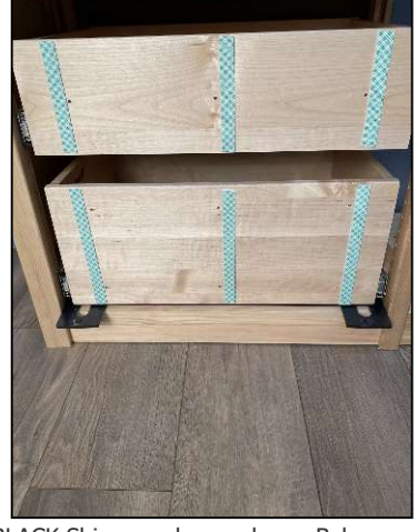
Starting with the first drawer, set the BLACK Shims as shown above. Balance them on the cross rail. These are 1/4"thick and will set the first gap.