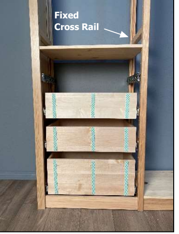
If you are installing a stack of 4 or more drawers, you may want to temporarily install the top shelf above your drawers first. Sometimes the fixed cross rail can make it difficult to install this shelf after drawers rails are installed.