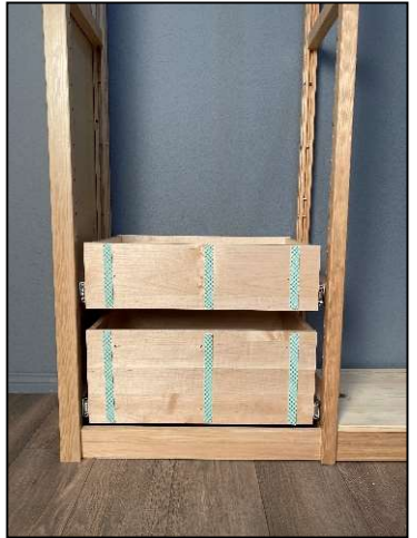
Install all of your drawers first, before attaching any drawer fronts.