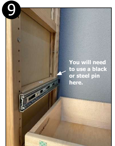
This is an example above where you have to use a Black Pin in the back of the upright above the rail.