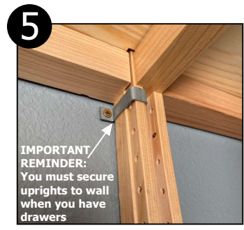
IMPORTANT: All frames must be secured to wall. See details on wall brackets.