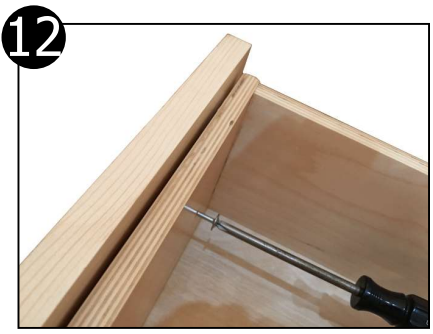
Screw our "Easy Grip" screws through the drawer box into the Drawer Front for a permanent installation.