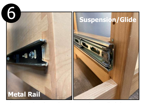
The metal rail on the drawer box will slide into the suspension/glide on the drawer rail.