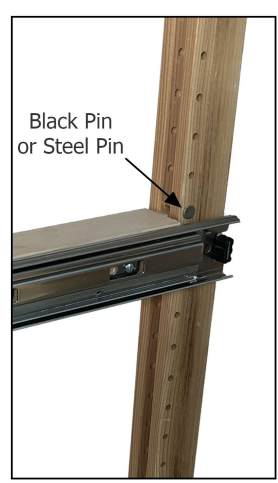
Set the 2nd set of Drawer Rails on the 3rd pin hole above the box just placed. Remember to add a pin above the Drawer Rail on the back upright to prevent the drawer from falling when it is pulled out. Use either the steel pin or gold pin depending on your access to the upright.