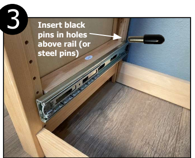
After the steel pins are set, insert Left and Right Drawer Rails to sit on top of the pins. IMPORTANT: Insert a steel pin above on the rear upright for each Drawer Rail. INSERT THE TOP STEEL PIN FROM THE OPPOSITE SIDE OF UPRIGHT. Or use our Black pins that are thinner and will be easier to slide over the drawer suspension. VERY IMPORTANT: These pins will prevent the drawer from falling when pulled out.