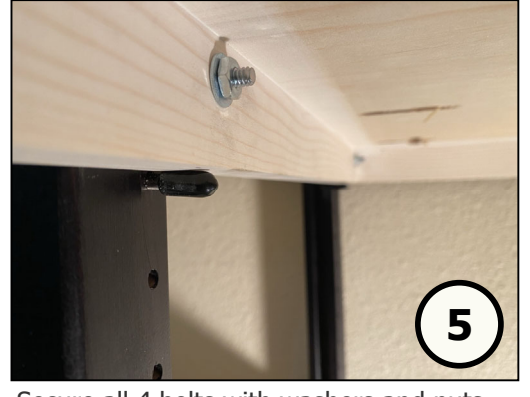
Secure all 4 bolts with washers and nuts. Secure the lock nuts on the ends of each bolt to prevent any nut from becoming loose over time.