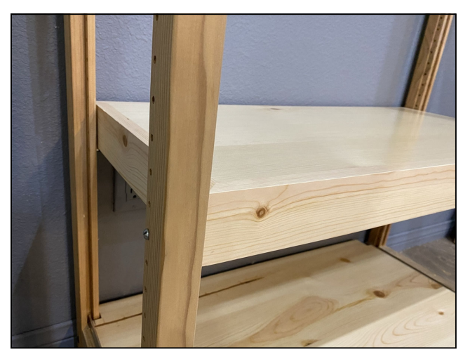
Your installation is complete!