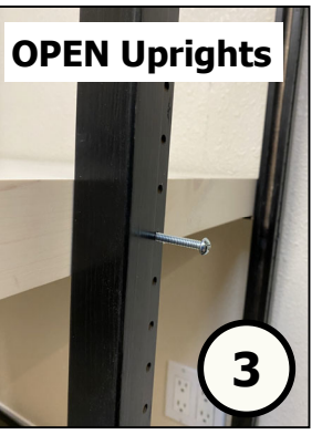
With OPEN uprights, you will insert four 2 1/2" bolts from the opposite sides of the uprights.