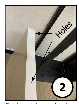
Set bench top onto pins with holes lined up with the uprights.